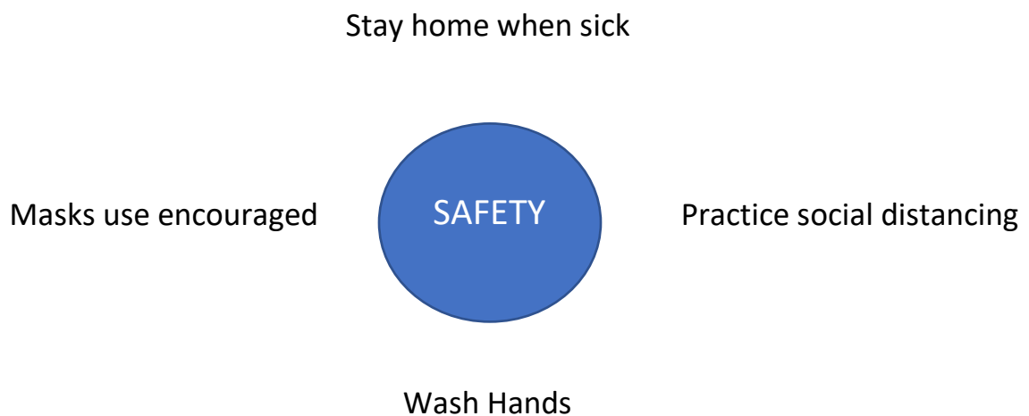
Table 3 - Basic COVID-19 Protection

These basic measures that can be taken to reduce risk of COVID-19 transmission are presented in the diagram below.